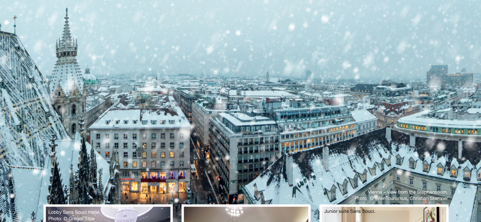
Vienna – view from the Stephansdom.