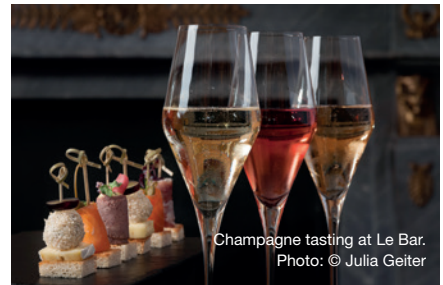
Champagne tasting at Le Bar.