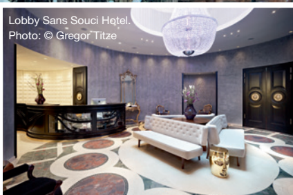
Lobby Sans Souci Hotel.