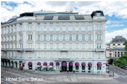
Hotel Sans Souci.

Winter Wonderland Vienna Special Offer 7 January – 27 February 2018 Enjoy a few days of relaxation in Vienna with a 20 per cent reduction (three nights minimum)